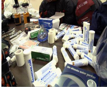
Supplies being packed in London

Significant funds are needed to buy supplies of medicines, fluids and other urgent requirements. Please speak to your local HF rep or visit our website www.humanityfirst.org to donate through your nearest Humanity First operation.