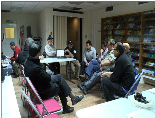
Team meeting in London last night

The next teams of more than 20 surgeons, paramedics and logistical personnel from the USA, Canada and the UK have left for Haiti via the Dominican Republic with significant supplies including antibiotics and other drugs, and 5 medical tents which will help to increase capacity for clinical work. We are grateful to some of the logistical carriers such as